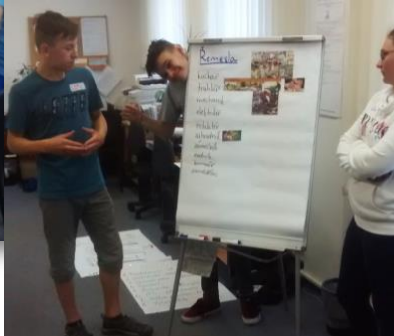
Student group visit – career choices